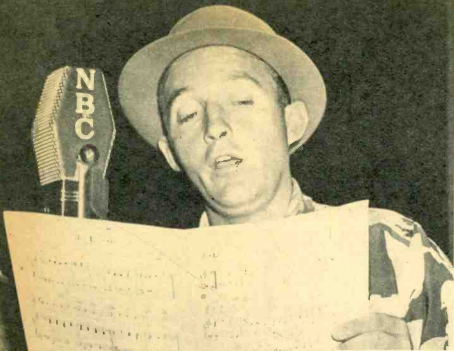
BING IN TYPICAL microphone stance, hat atop thinning hair, "groans" relaxedly while John Scott Trotter's orchestra backgrounds with music.