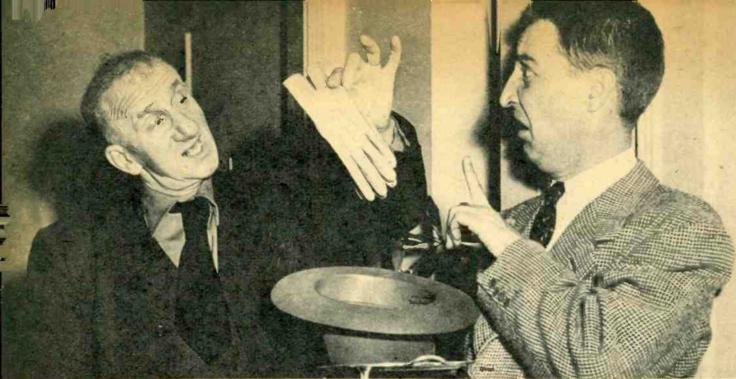
▲ THE HORRIFIED LOOK on Junior's face stems from the fact that Jimmy doesn't seem to catch on that the tray Garry's holding isn't for hat, gloves and overcoat (if he had an overcoat) but only for the J. Durante calling card. Oh, well, this is only the beginning. Don't miss the rest—if you can!