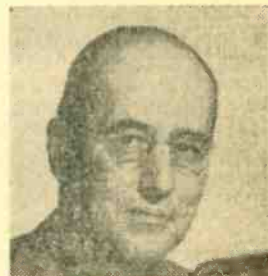
"FAMOUS MUSICAL FAVORITES" with